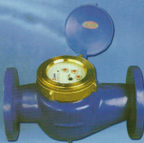
TYPE LXS 50 E